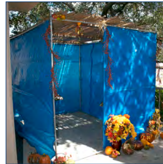
AT LEFT: The Golden Estates sukkah.